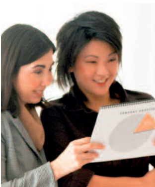
Image quality, ease of use, productivity, media latitude, feeding and finishing options, plus world-class workflow solutions are at your fingertips. Grow your digital colour printing capabilities and reduce costs with the Xerox® Colour 550/560 Printer.